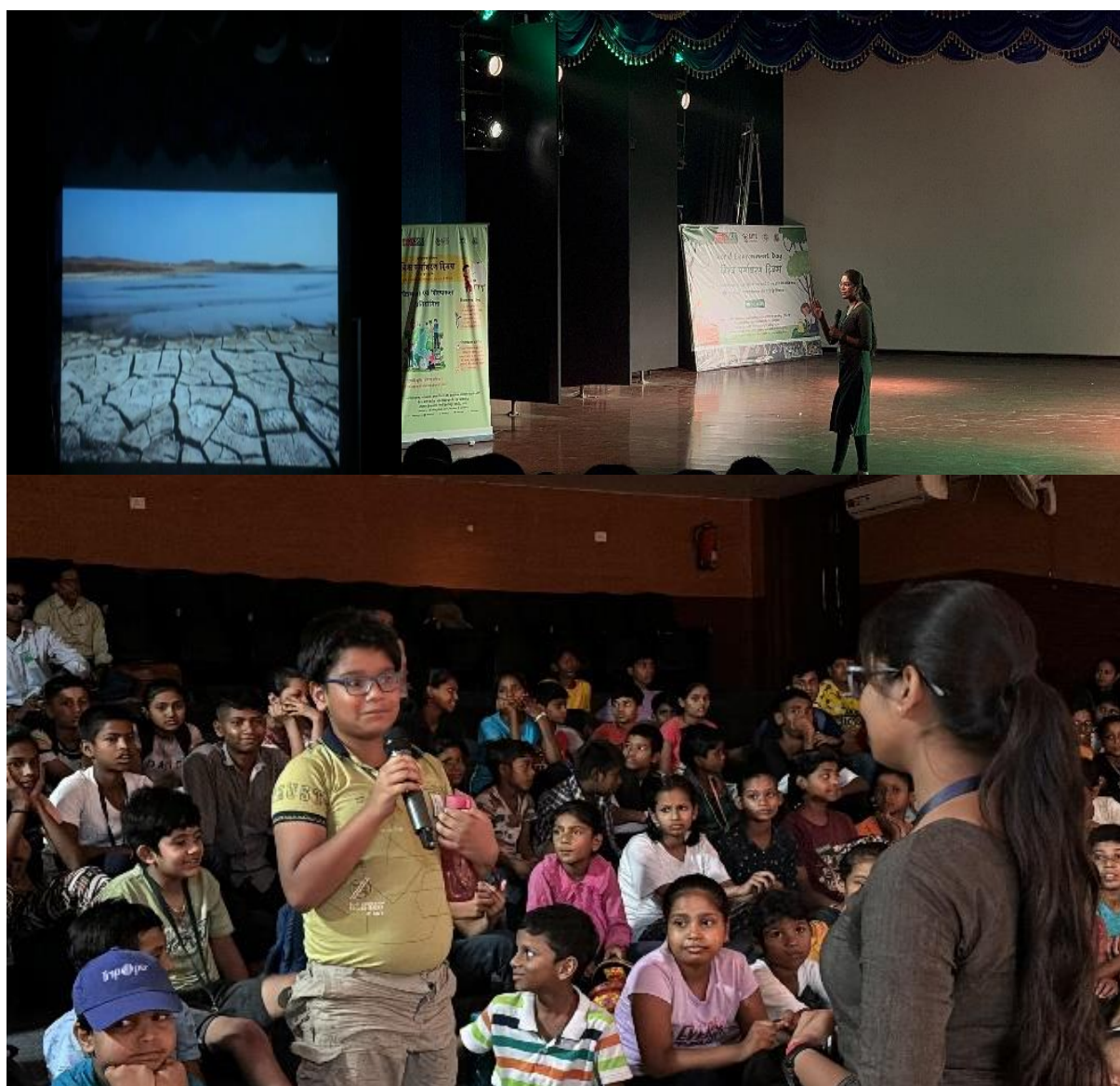
Glimpses of Lecture Session

A lecture was delivered on 'Land Restoration, Desertification and Drought Resilience' by the EIACP team. The lecture covers the history and importance of Environment Day. A short video on the effects of climate change around the world was screened. The session highlighted the issues of deforestation, extreme events, desertification, water scarcity, pollution etc. The students were highly interactive with their questions and ideas. At the last of the session, a video on mission lifestyle for the environment was played which highly motivated the students to adopt eco-sustainable alternatives for environment conservation.