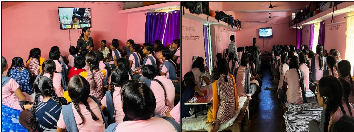
Glimpses of Lecture Session

A lecture was delivered on 'Land Restoration, Desertification and Drought Resilience' by EIACP team. The lecture covers the impact of climate change. The session highlighted the issues of deforestation, extreme events, desertification, water scarcity, pollution etc. At the last of the session, a video on mission lifestyle for environment was played which highly motivates the students to adopt eco-sustainable alternatives for environment conservation.