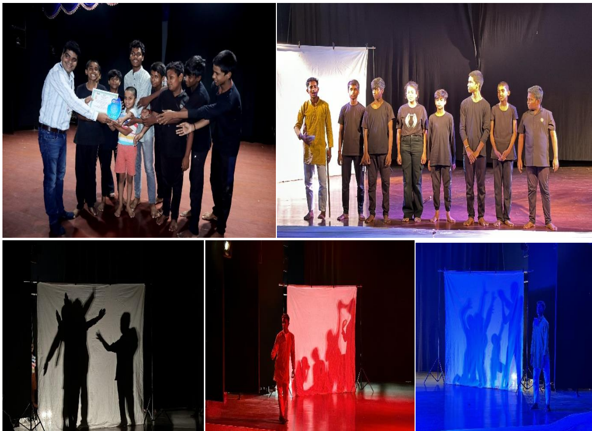
Group C (The Shadow Team)