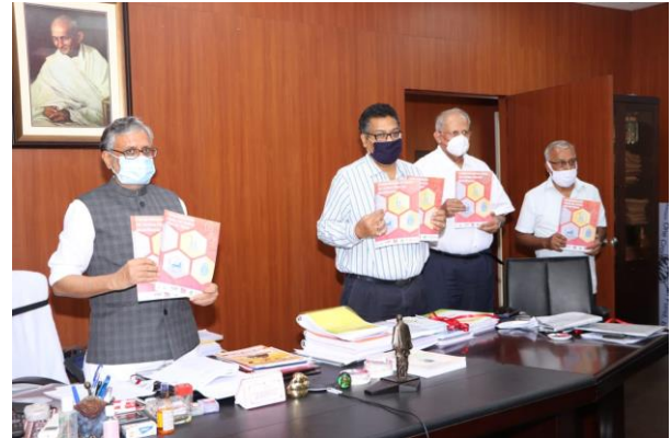
Launch of the GCAAP & MCAAP Reports September 23, 2020

The reports of 'Gaya and Muzaffarpur Clean Air Action Plan (GCAAP & MCAAP)' were launched on September 23, 2020 by Hon'ble Deputy Chief Minister of Bihar Shri Sushil Kumar Modi. The virtual launch programme was organized by the Centre for Environment Energy and Climate Change (CEECC) - ADRI. Along with launching of the reports, there was also a special lecture on air quality management in Bihar and a discussion on the implementation strategies, challenges and way forward on GCAAP and MCAAP in Bihar's context.